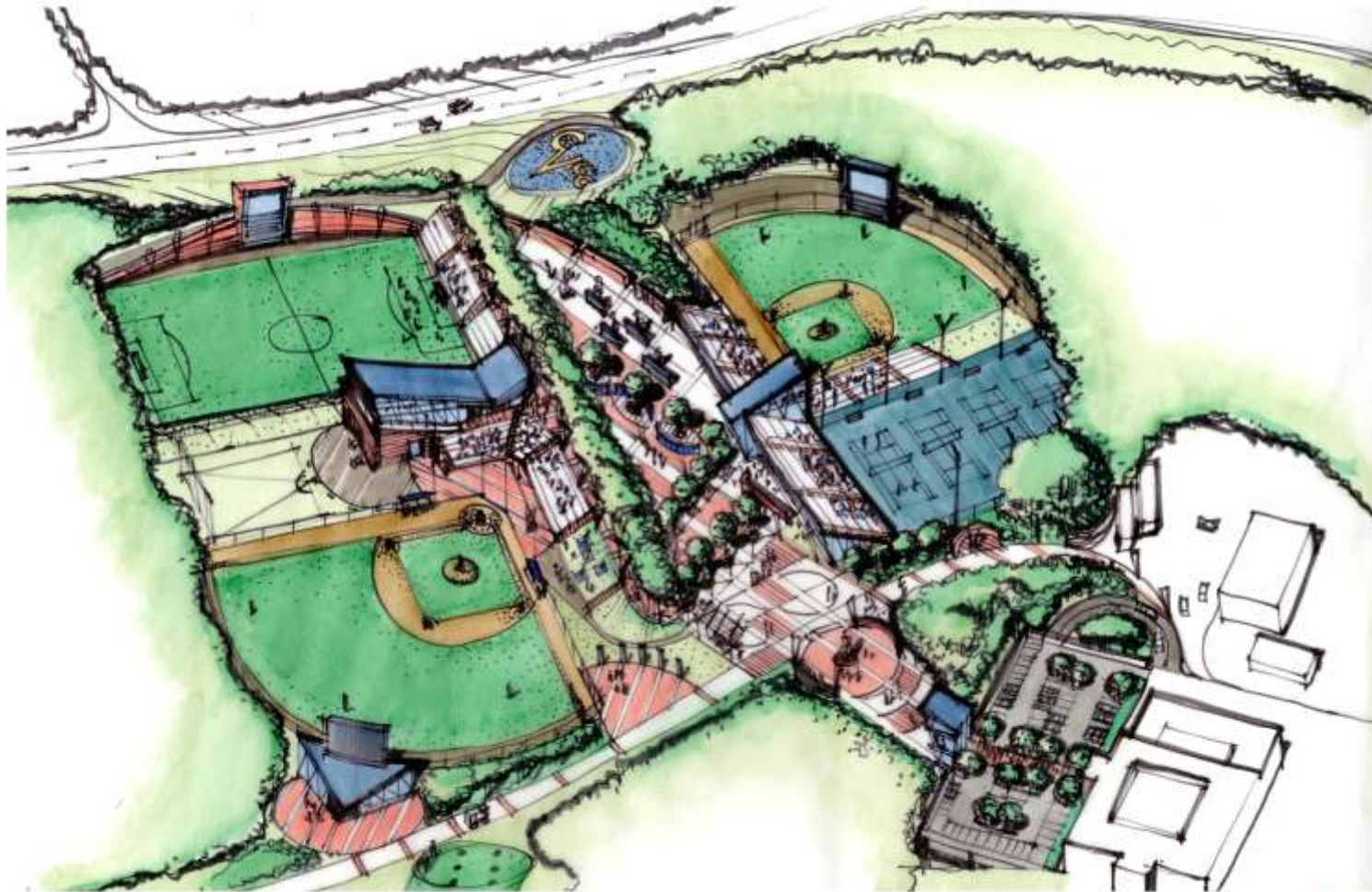
CENTRAL VIRGINIA COMMUNITY COLLEGE | SPORTSPLEX Virginia Community College System | Lynchburg Virginia