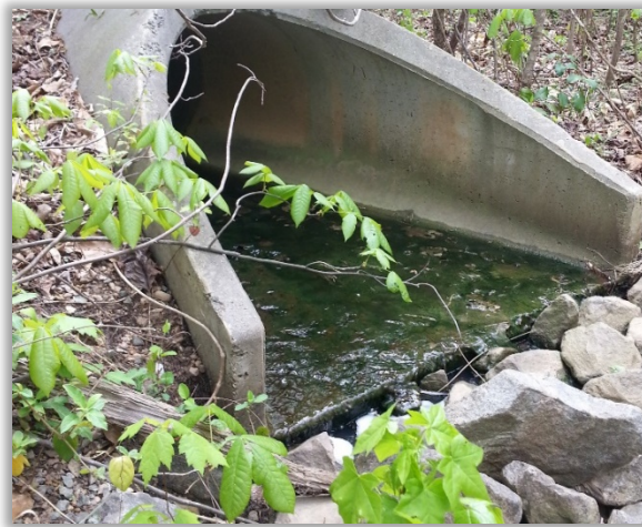
Figure 3. Example Photo showing algae growth.